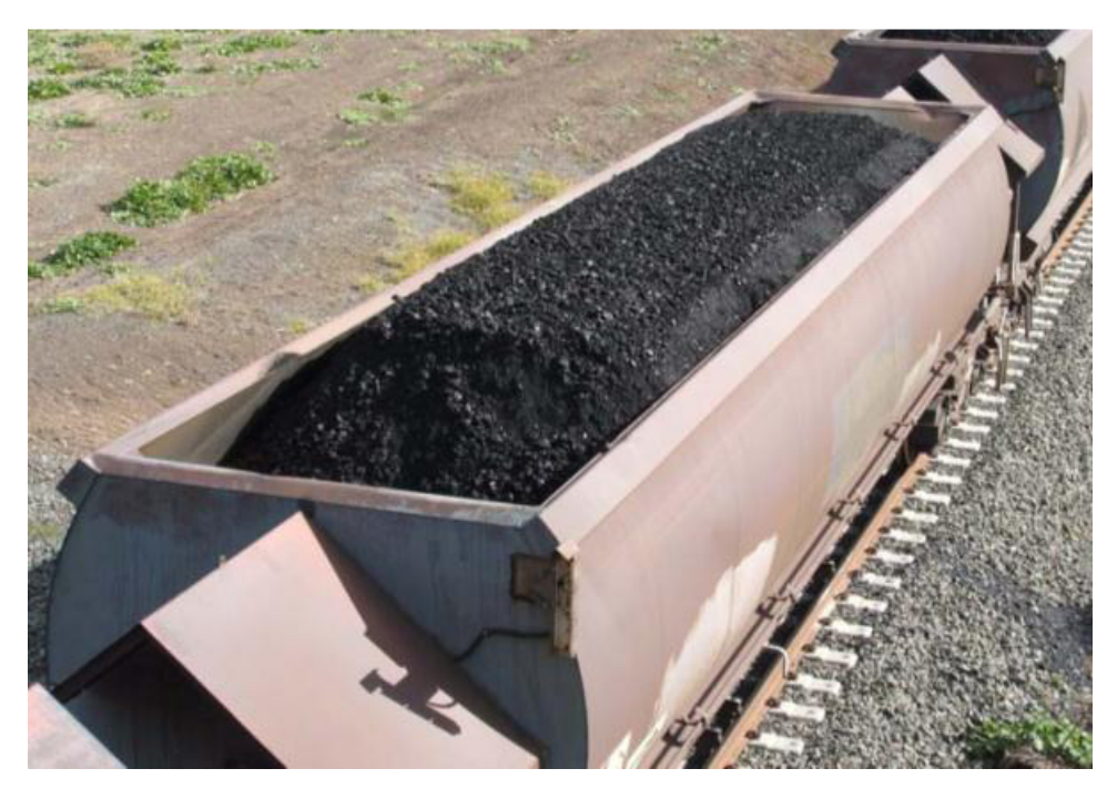
Figure 2 - Top of loaded coal wagon showing 'Garden Bed' style profile.