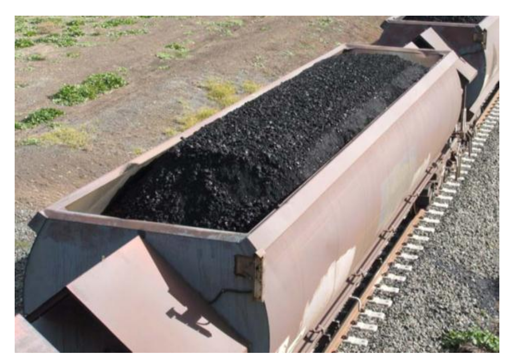
Figure 2 - Top of loaded coal wagon showing 'Garden Bed' style profile.