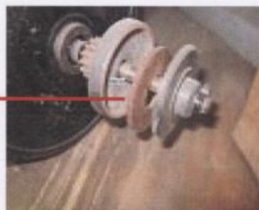
Model 10boom gate