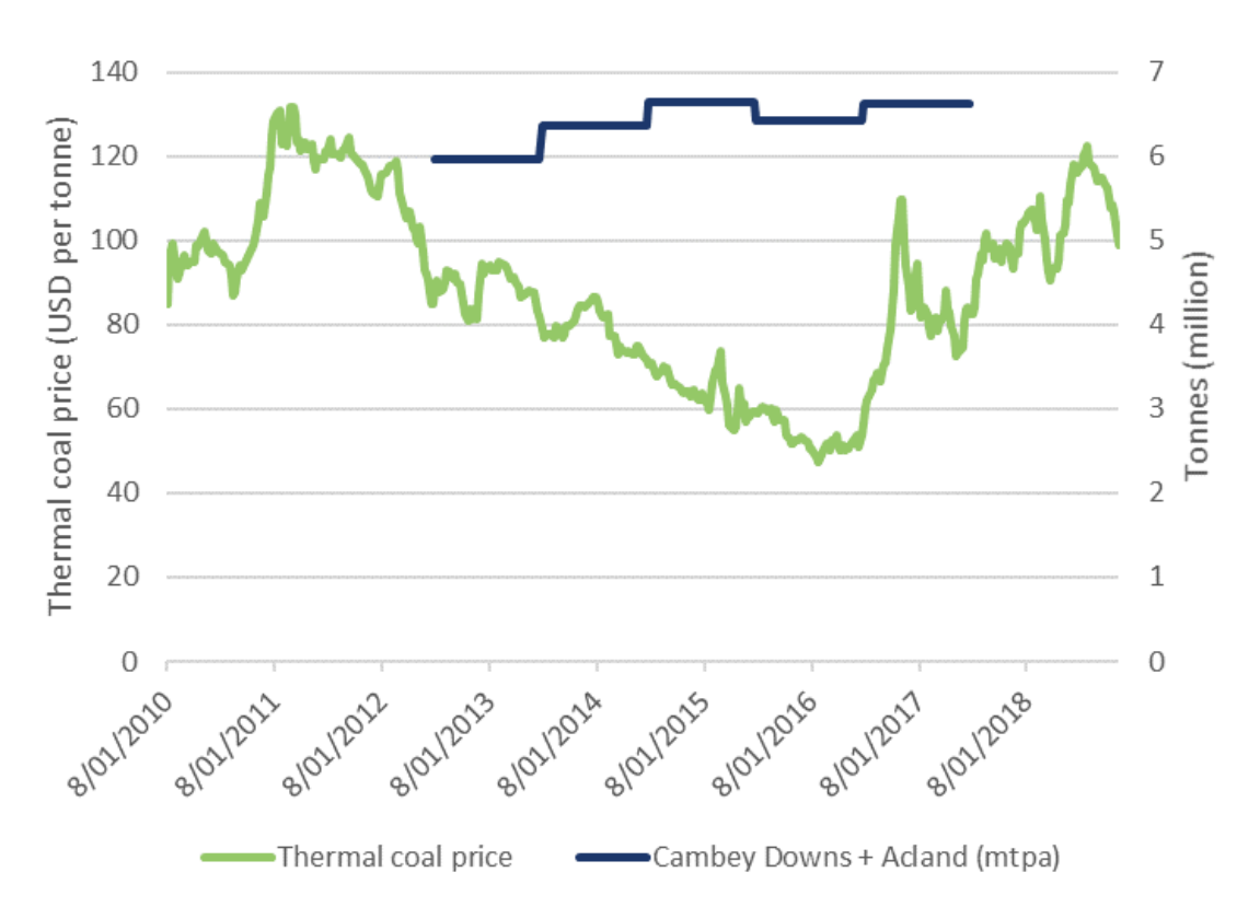
Figure 2.1: QR-Coal – Export volumes vs Thermal coal price