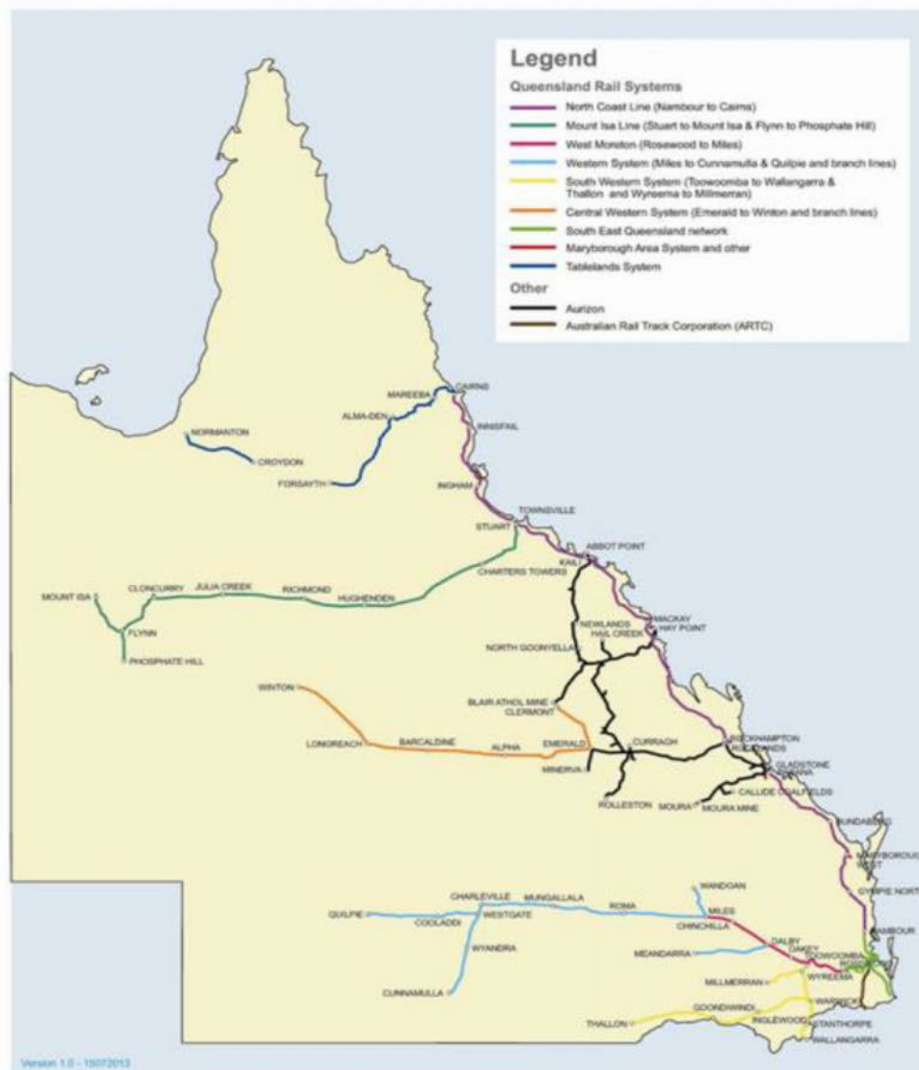
Figure 1: Rail networks in Queensland