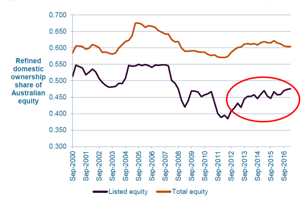
Figure 4.3 Refined domestic ownership share of Australian equity