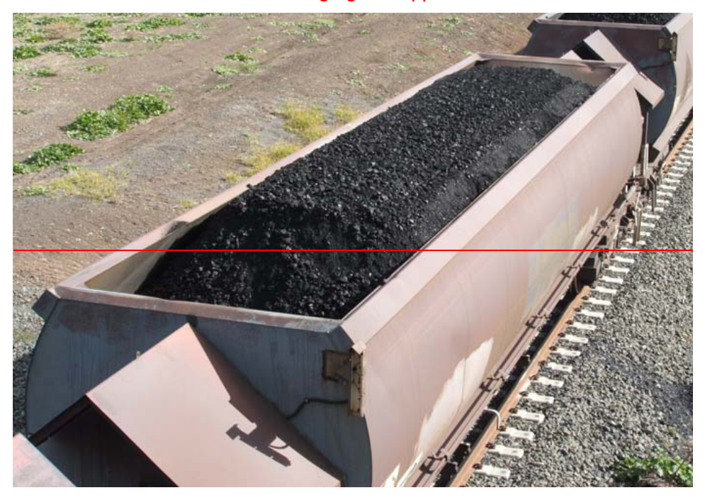
Figure 2 - Top of loaded coal wagon showing 'Garden Bed' style profile.

veneering agents applied in order to Prevent Coal Loss. Without limiting the type of profile that the Private Infrastructure Owner may adopt, an appropriately designed and maintained telescopic loading chute can achieve a 'garden-bed' profile (standard loading profile as shown in Figure 2 below.) to mitigate the risk of coal lift-off and to optimise the effectiveness of veneering agents applied in order to Prevent Coal Loss.