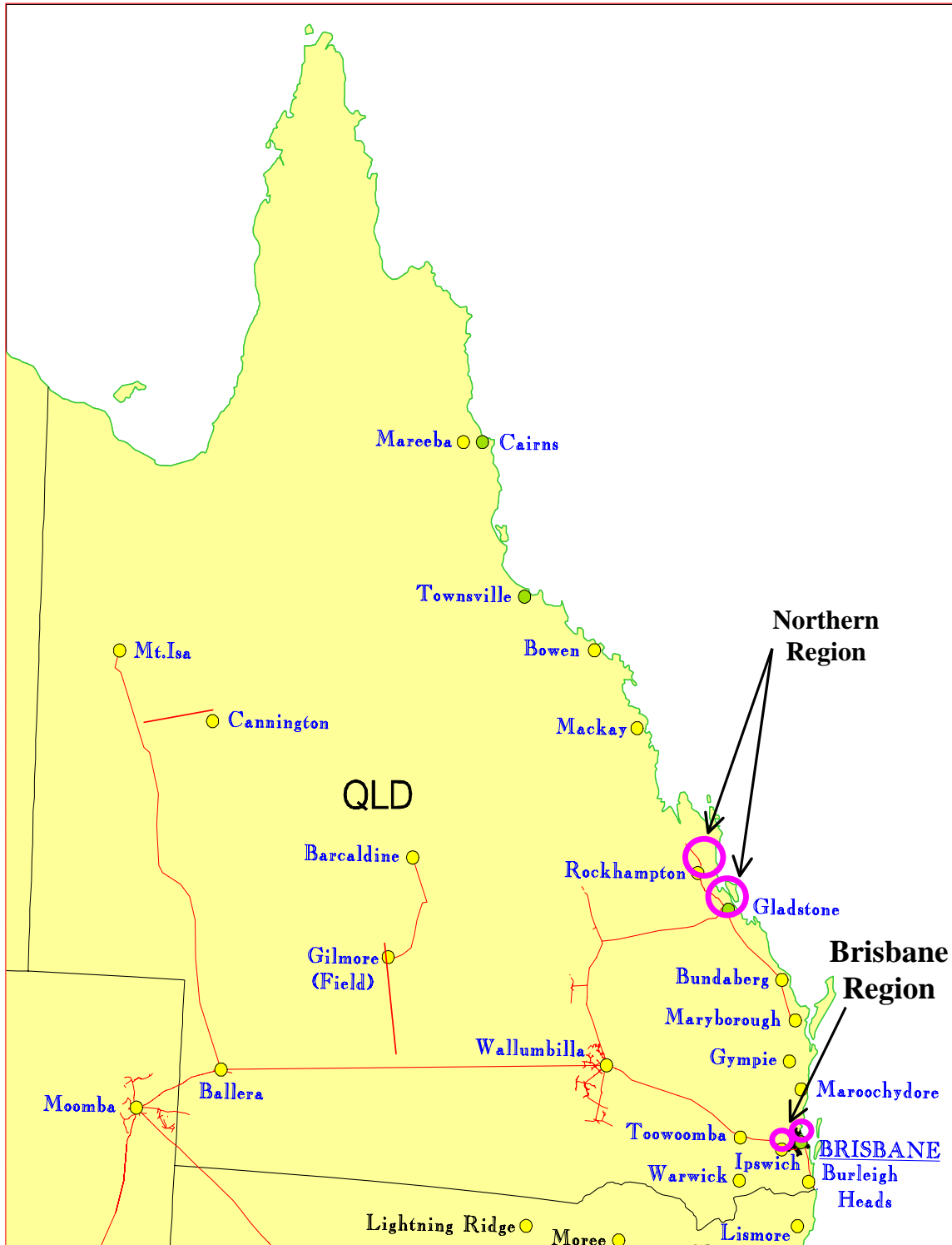
Map showing Regions of the Network